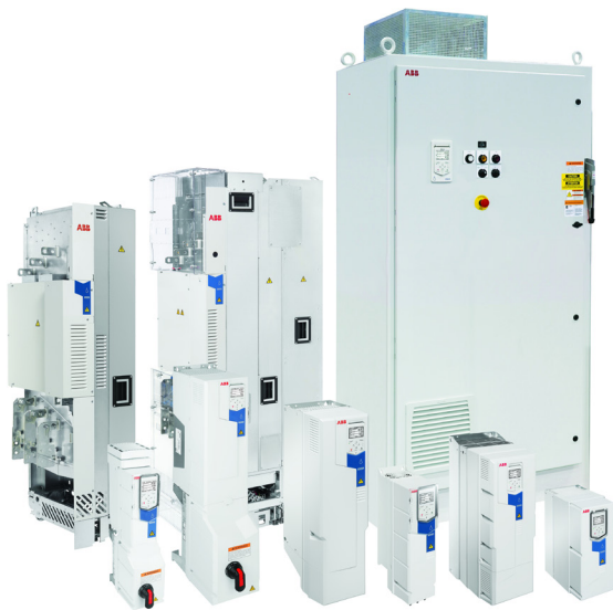
ABB Inc Drives 16250 W. Glendale Drive New Berlin, WI 53151